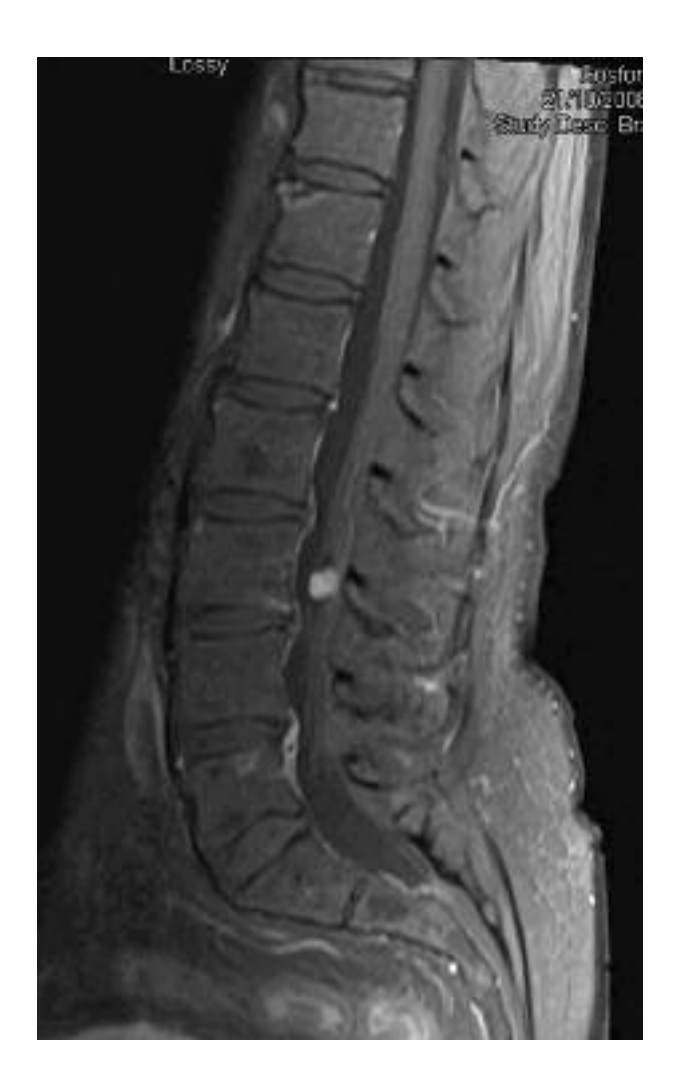
FIG. 1a. — T1 weighted gadolinium-enhanced sagittal MRI of the lumbar spine showing avid homogeneous enhancement of the lesion. This should raise the suspicion of a possible vascular tumor.

It was felt that the lesion should be surgically removed, largely because of its uncertain significance. A laminectomy was performed from L2-4 and a classical 'cherry-red' lesion was found adherent to the filum terminale (Fig. 1b). A feeding artery and vein were seen entering the tumor along the filum terminale from above. The tumor was removed 'en bloc' by dividing the filum above and below. The tumor measured 1.4 \times 1.3 \times 1.1 cm and demonstrated the typical microscopic pattern of numerous